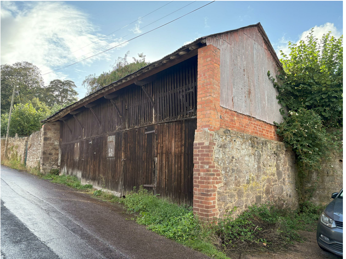
Barn and Land at Hele